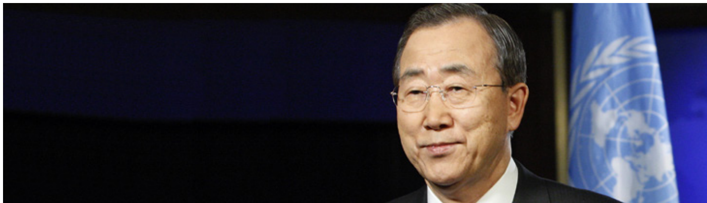
Ban Ki-moon, Secretary-General of the United Nations