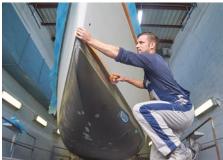
Excellent handling and UV resistance

With these characteristics, the tesa® Precision Mask 4342 is suitable for a broad range of different application conditions and gives you more flexibility in planning and executing outstanding paint jobs. Just give us a call and try it for yourself.