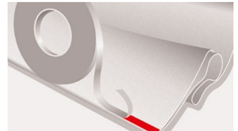
Fabric and textile mounting