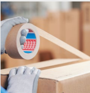
For light-weight packaging