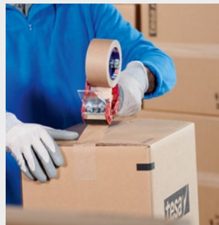
Excellent adhesion on different types of recycled cardboard