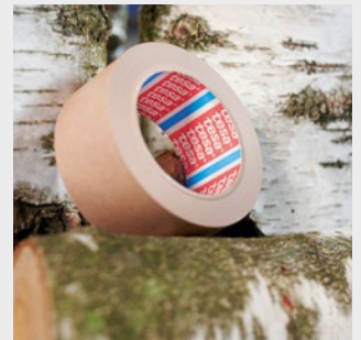
Paper from well-managed FSC®-certified forests and other controlled sources