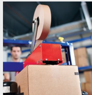
For manual and automatic application