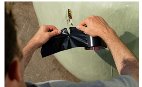
Can be torn by hand for easy application